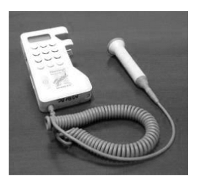
Fig. 4. Handheld Doppler device.

It takes time to develop clinical expertise with intermittent auscultation when performed with a fetal stethoscope [8,9]. Initially it may not be easy to recognize the fetal heart sounds, and later there is a slow learning curve for the identification of accelerations and decelerations. Even for the most experienced healthcare professionals, it is impossible to recognize subtle features of the FHR, such as variability. Using fetal stethoscopes, awkward positions sometimes need to be adopted for effective auscultation and therefore healthcare professionals should ensure good ergonomic position for themselves and the laboring woman when using intermittent auscultation. Also with these instruments, there is no independent record of the FHR and usually no confirmation of the findings by other healthcare professionals, or by those in the room. This may cause uncertainty in case reviews and medico-legal cases.