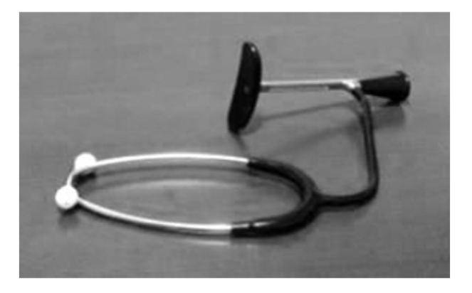
Fig. 3. A DeLee stethoscope.

assessment of other physical parameters such as maternal skin tone, temperature, breathing patterns, direct palpation of fetal movements, and maternal contractions.