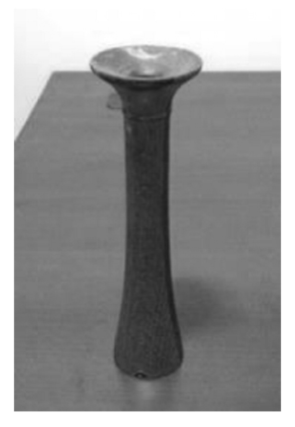
Fig. 1. A Pinard stethoscope.

for CTG monitoring are available, intermittent auscultation may be used for routine intrapartum monitoring in low-risk cases (Table 2). However, approximately half of the panel members believe that continuous CTG should be the option during the second stage of labor, although there is no direct scientific evidence to support this.